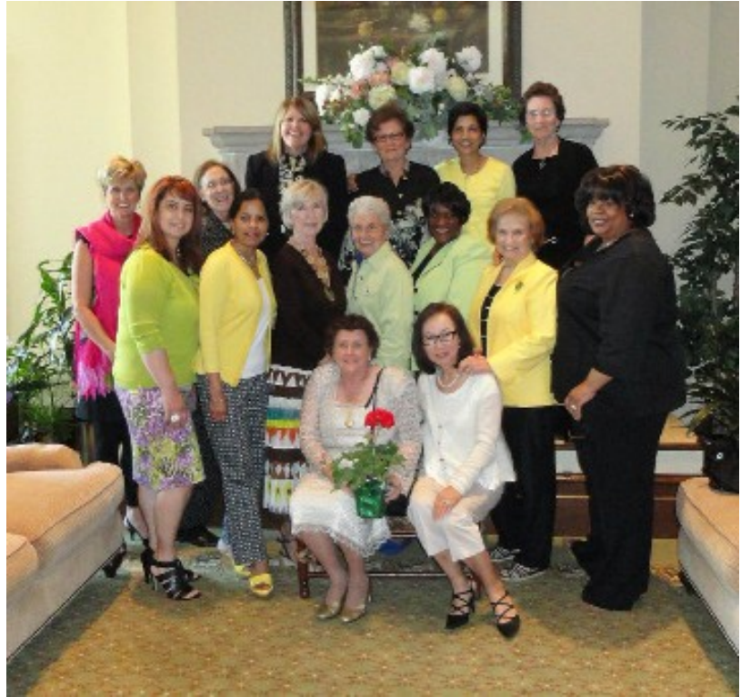
2011 Geranium Luncheon - Past Presidents

Genesee County Medical Society ALLIANCE FOCUS 4438 Oakbridge Dr., Suite B Flint, MI, 48532